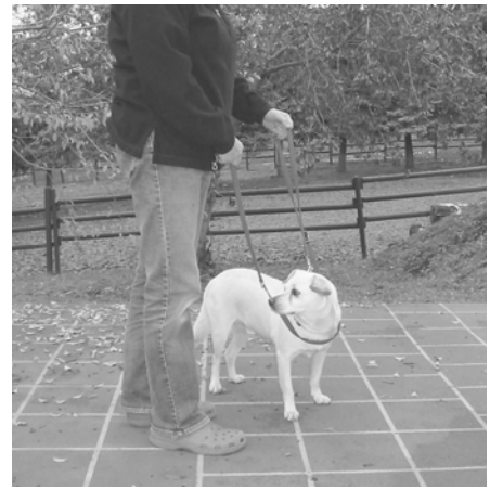
Photo: Shows the balance leash on a small dog. Sometimes the leash will slide up with a small dog, or a dog that is quite strong. In those cases use the Balance Leash plus as shown below.