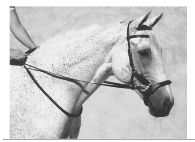
Photo 5: Combining the Lindell with the Balance Rein helps young horses learn to carry themselves in balance. In this photo the Lindell rein is held on the outside of the little finger and the ring finger holds the balance rein.

Horses who have difficulty with downward transitions are often out of balance and falling forward, pulling on the reins generally triggers the head to come up and the back to drop. The balance rein helps signal the horse to shift his weight off the forehand and steadies him without tightening the horse's neck and back.