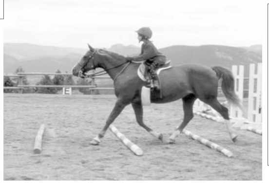
Photo 7: This is from the Let's Ride book and shows the use of the balance rein to steady the rider's hand and prevent balancing on the horse's mouth.